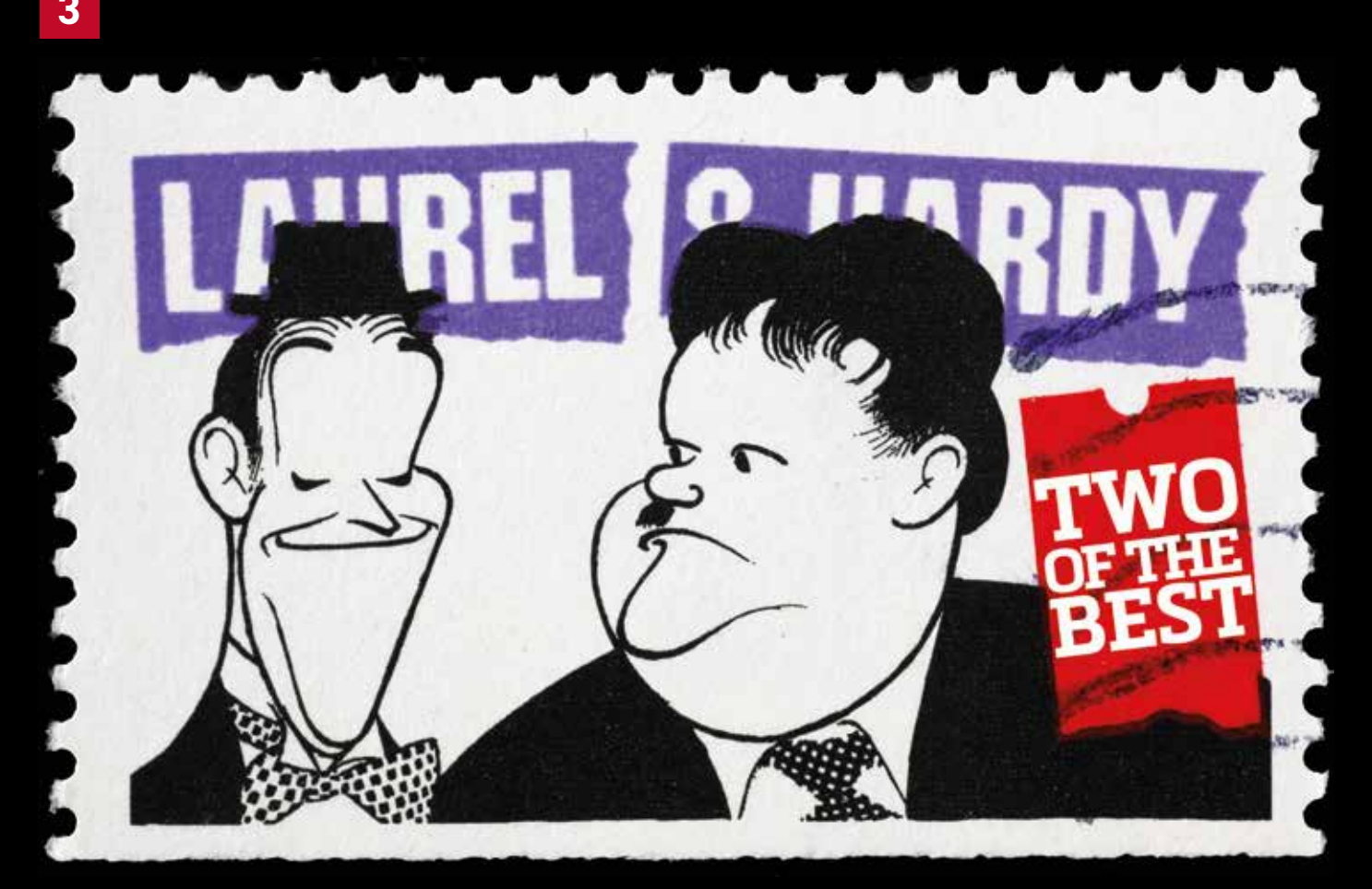
In 2025, two of the world's outstanding trade fairs – Bauma Munich and Agritechnica Hanover – come together in one year. Like the Hollywood screen legends of the past, each of these great events are stars and has a unique personality of its own.

They're a wonderful opportunity to further your company's promotion and sales, so we urge you - don't let the laughter turn to tears. Make sure you get every possible benefit by advertising your company's presence and products at these leading shows in our iVT exhibition preview magazine issues. That way iVT's 25,000+ OEM readers are guaranteed to join in the party!